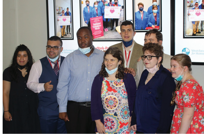
The first cohort graduated in May 2022.